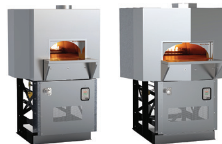
mt. chuckanut 4'