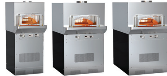
bistro home 3030*